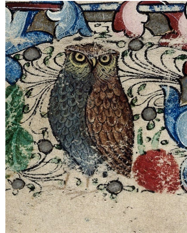
Owl, Book of Hours, London, c. 1460; Harley MS