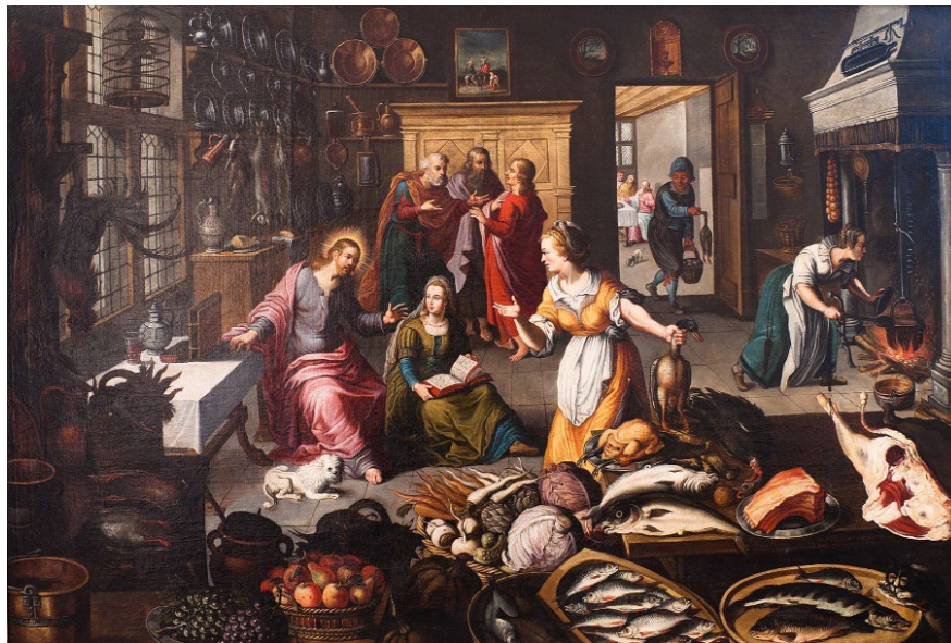
Christ Visits Mary and Martha - Joos Goeymare (1573-1611)