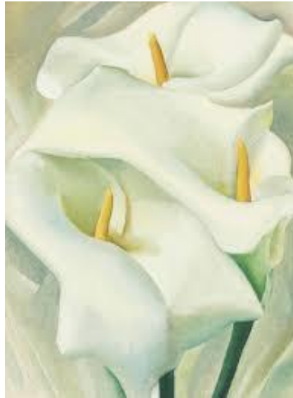
Image by Georgia O'Keefe

Reflection: Jesus is the light of the world, the bread of life, the gate, the Good Shepherd, the way, the truth, and the life, the true vine, I AM who I am, and Jesus is - still, now, always - the resurrection and the life. And on the days when I believe this, it changes everything. On the days when I believe this, I'm not afraid and I know we will all be free... On the days when I believe this, I believe death is a dawn and never the last word... On the days when I believe this, I believe that ongoing hope of resurrection changes how we engage in our lives as they stand right now as we love and know and walk with God who brings life out of death, order out of chaos, healing out of sickness, wholeness out of brokenness.