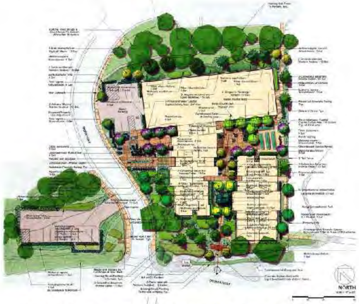
THE NEW PARKING AREA IS AT THE LOWER LEFT OF THE SITE MAP. Orinda Way crosses at the bottom of the map; Irwin Way ascends vertically up the middle.

OCC's Fellowship Hall and Sanctuary are located up here.